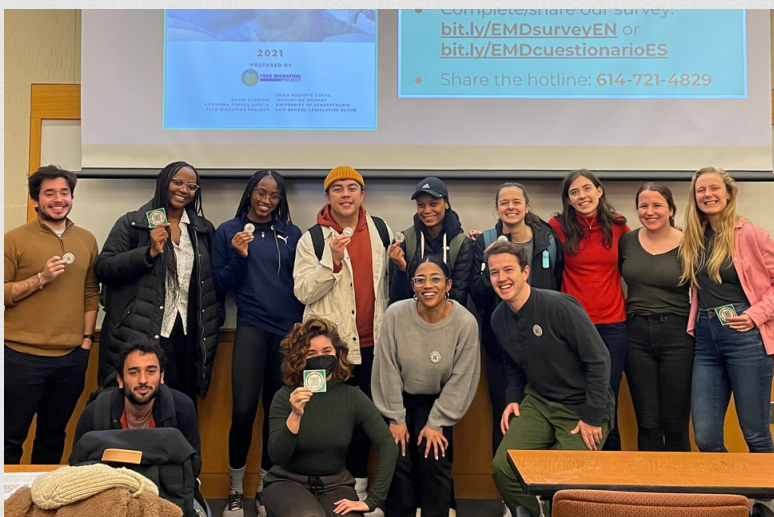
November 30, 2022: Members of the End Medical Deportation Campaign held an information session with Jefferson University medical students on the role of students in organizing against medical deportations.

Free Migration Project continues to lead the coalition that formed in regular meetings to organize against medical deportations. We have produced a comprehensive report about medical deportation, launched a research project to better understand people's knowledge about medical deportations and created an End Medical Deportation hotline. We have also been laying the groundwork to engage Philadelphia City Council in establishing local policies that protect immigrants in medical deportation cases. We hope that this campaign brings together many sectors of the community to put a stop to this heinous practice. Hospitals should not be deporting immigrants, and immigrants should not have to fear deportation when they are seeking medical treatment.